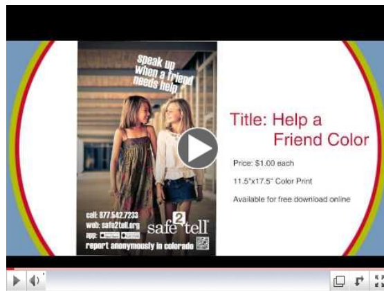
Safe2Tell Poster Catalog

Posters to Download and Print: Click here to view pdf files of the new posters available for you to print