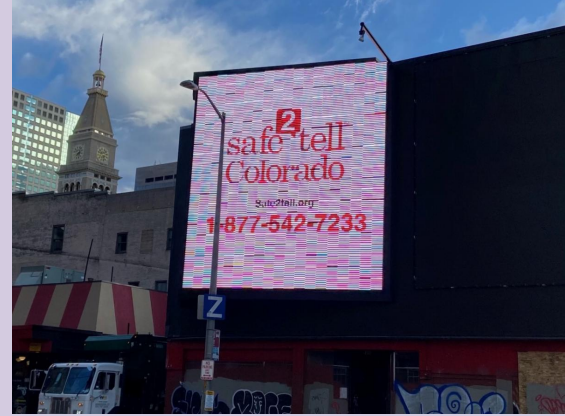
A LED digital billboard in downtown Denver plays a S2T public service announcement

Advertising for helping spread awareness of the S2T program.