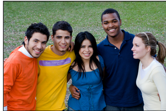
You can help keep Colorado students safe by calling 1-877-542-7233 (SAFE).

Increasing our knowledge and awareness of the warning signs of suicide can better enable us to identify when a friend or loved one is at risk.